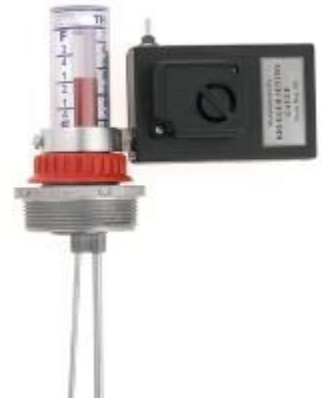
Direct Mount Alarm

Glass Calibration- The internal piece of the calibration becomes glass. Provides protection from heat, fumes, weathering, and also helps with passing fire inspections. (part # add -GLC)