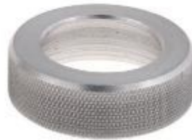
Aluminum Lock Nut