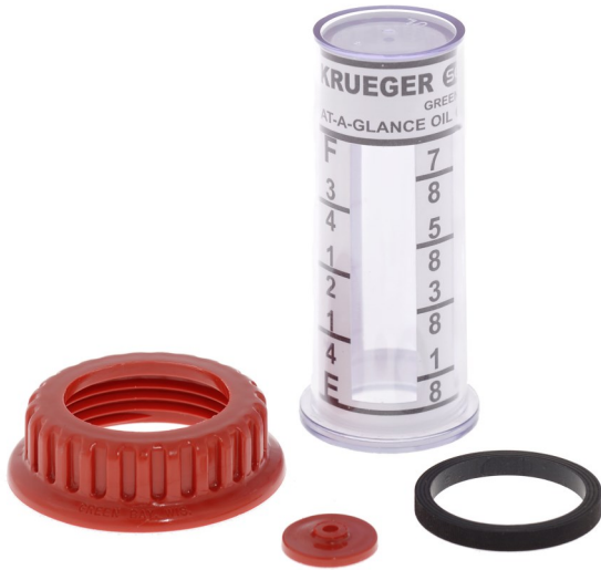
D Repair Kit